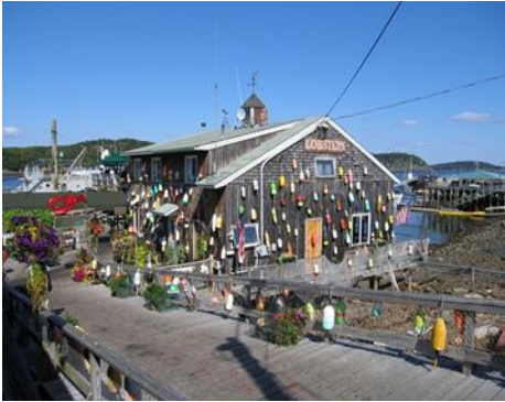
Bar Harbor, Maine