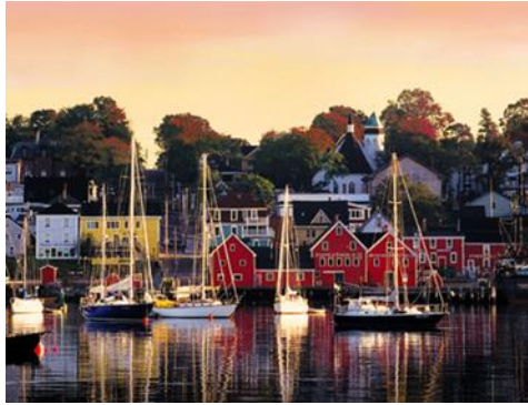
Lunenburg, Nova Scotia