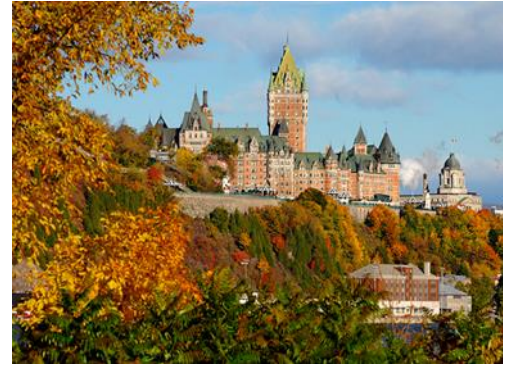
Québec City, Québec

Cruise the magnificent seas of New England and the Maritimes to Montreal.