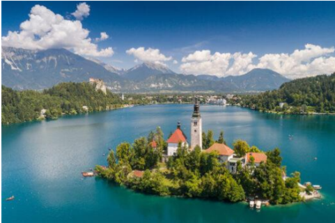
Lake Bled, Slovenia