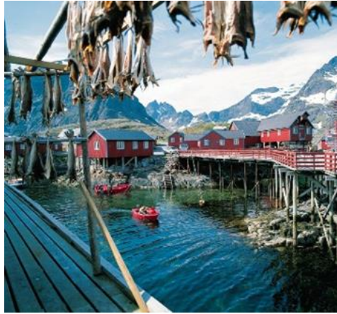
Lofoten Islands Excursion