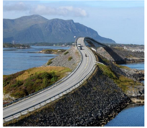
The 'Atlantic Road'