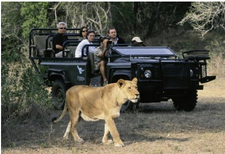
Game Drive Safaris